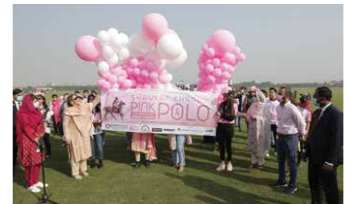
Begum Samina Alvi, the First Lady of Pakistan, inaugurating a breast cancer awareness event at the Jinnah Polo Fields in Lahore.