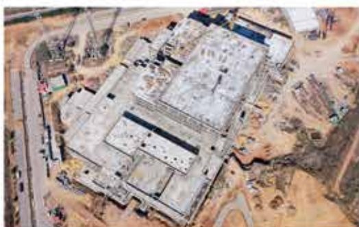
Constructed Area: 1 million sq. feet