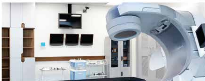
State-of-the-art equipment for diagnosis and treatment of cancer

The physical structure of Pakistan's largest tertiary care cancer centre was completed in late-November, 2022. Finishing work has commenced and the installation of equipment will be carried out throughout the coming year. The hospital will be equipped with the latest in technology for both diagnosis and treatment, and will be staffed by highly-qualified professionals. It is expected that the hospital will open at the end of December, 2023, Inshallah, when it will continue the tradition of our hospitals in Lahore and in Peshawar by providing state-of-the-art cancer treatment free of charge to the underprivileged.