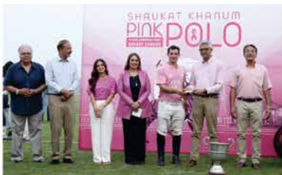
Iqra Aziz, TV actor and Shaukat Khanum Breast Cancer Awareness Campaign ambassador, attending the "Pink Polo" event, organised by SKMCH&RC, Lahore, in collaboration with Jinnah Polo Fields, to raise awareness about breast cancer.