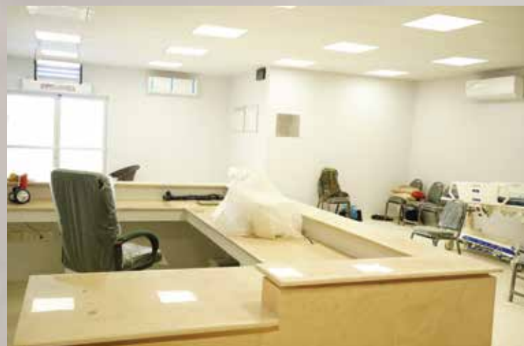
Inside the new Walk-in Clinic at SKMCH&RC, Karachi