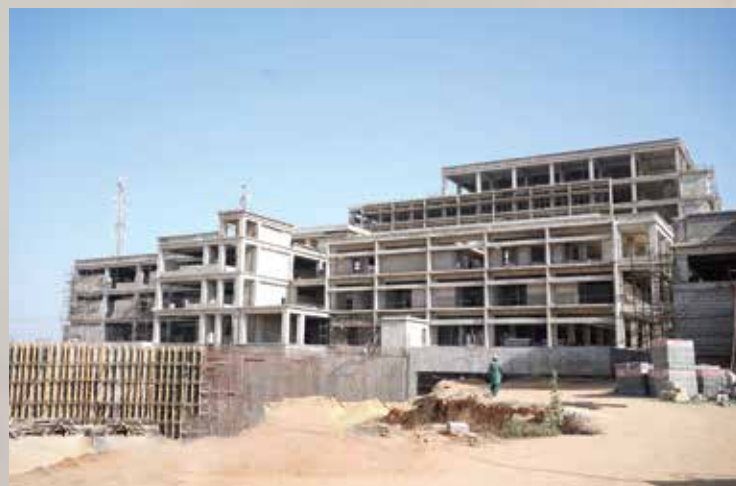
An external view of SKMCH&RC, Karachi