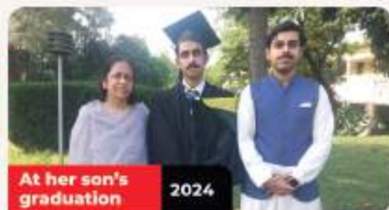
At her son's graduation

After clinical evaluation, cancer patients needing financial support undergo a one-time financial assessment. Those deemed eligible for Zakat receive subsidised treatment, with over 75% of patients receiving all treatment completely free of charge. Shaukat Khanum Memorial Trust ensures that all Zakat is disbursed within the year of collection and used in accordance with Islamic principles. Zakat management at SKMT has been independently certified as being fully Shariah-compliant.